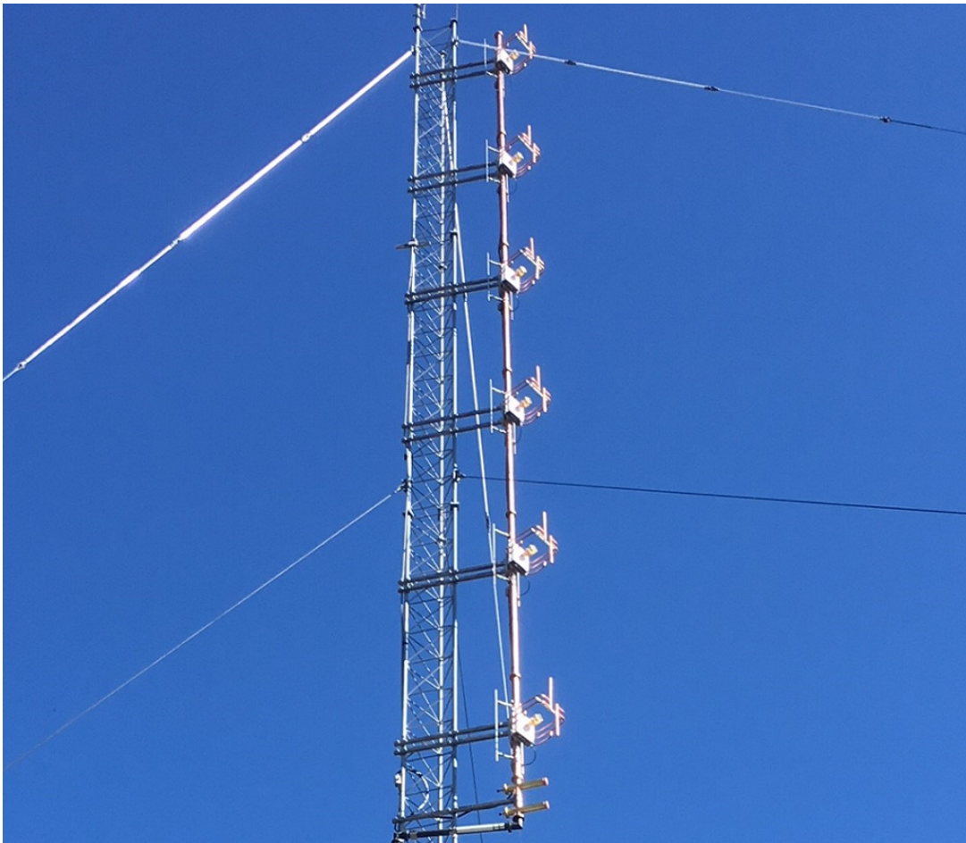
Thanks to the guys from GE!