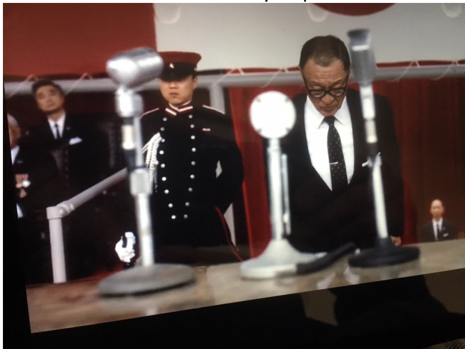
Watching on Amazon, in a series called "Man in the High Castle", low and behold, a D-104 microphone on the podium!