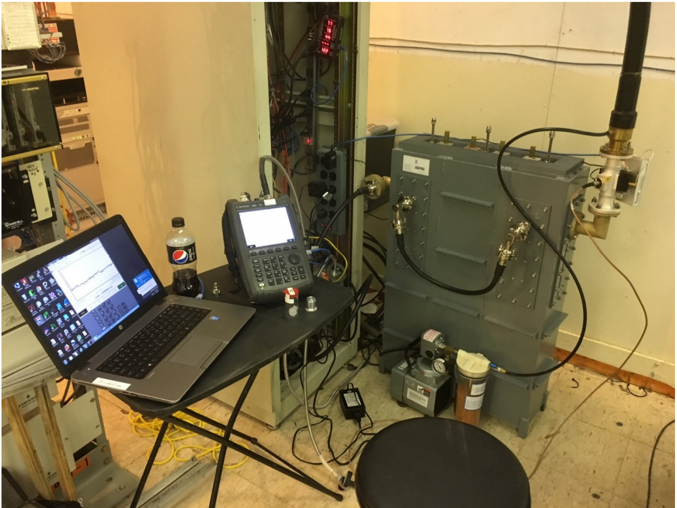
More summertime work! Proofs of our stations go on, using the connection back to HQ, the Field Fox, and Bird BPME's. Makes it easy and quick!