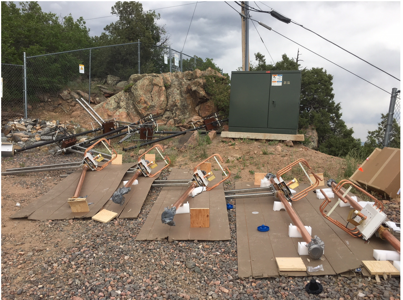
The old antenna removed and new antenna ready to be deployed