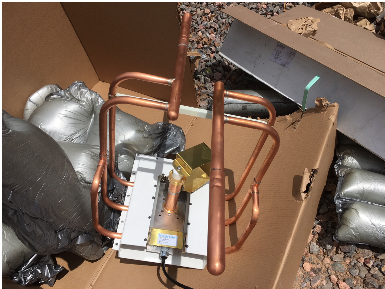
One of the shiny new antenna bays unboxed