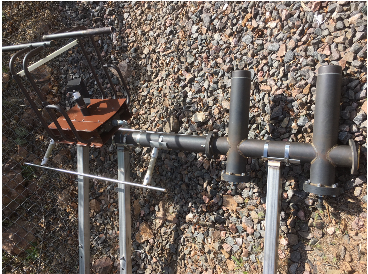
The old antenna bay number 1 and tuner unit