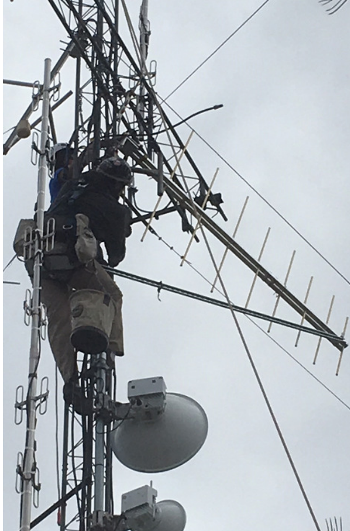
Up goes the receive antenna on the VERY busy tower site and the antenna installed